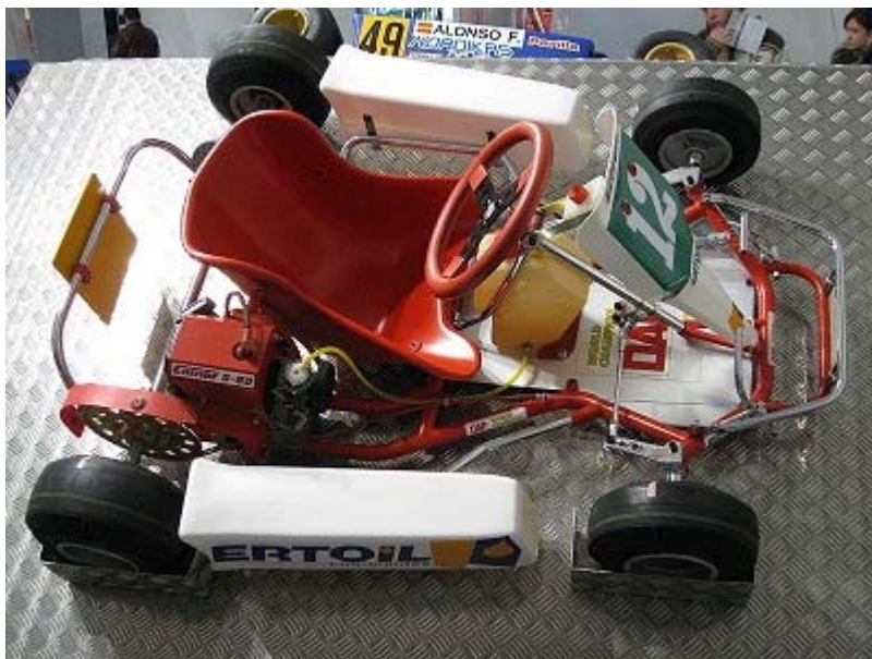
Fernando Alonso's first championship winning kart, Comer Cadet circa 1991.