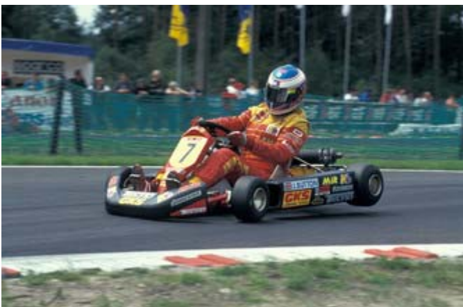
Jenson Button, 1997 CIK-FIA European Champion, Formula Super A.