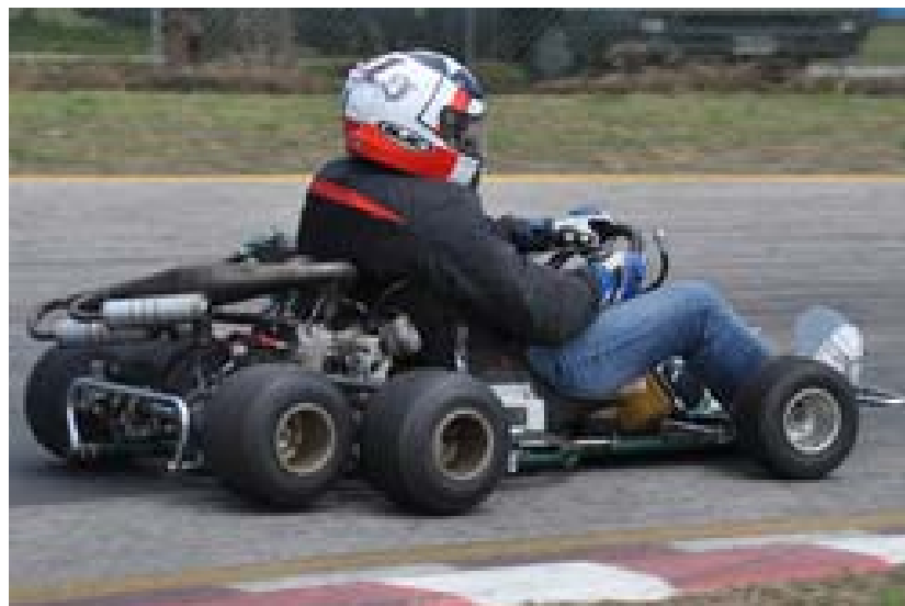
Need more traction? 1977 experiment.

There have been 10 proposals submitted to Rules Round 25. Eight from Clubs and two from the Executive. To view the proposals CLICK HERE . Responses from Clubs are due by 29 July.