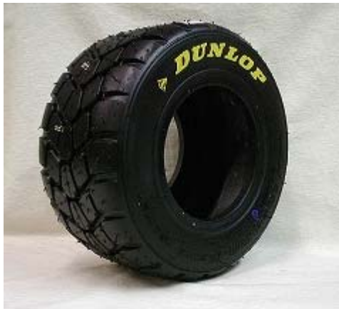
PHOTO OF TYRE

Specification sheets are attached hereto.